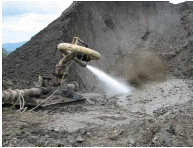
Fig. 2. Monitoring Gun in Operation at Boete Slimes Dam 6.

At BSD hydraulic mining is employed to exploit the ore, which consist of old tailings material that originated from the old treatment plant called Pompora Treatment Plant (PTP). Hydraulic mining uses the energy in a fluid to do work and represent a practical application of Bernoulli's equation [3]. Fig 2 shows a monitoring gun in operation at BSD 6. The material (slurry) at a pulp density of 40-45% from BSD is pumped to the Tailings Treatment Plant (TTP) where there is re-pulping of the slurry from 75% passing 75 microns to 80-85% passing 75 microns before gold extraction by the conventional CIL method.