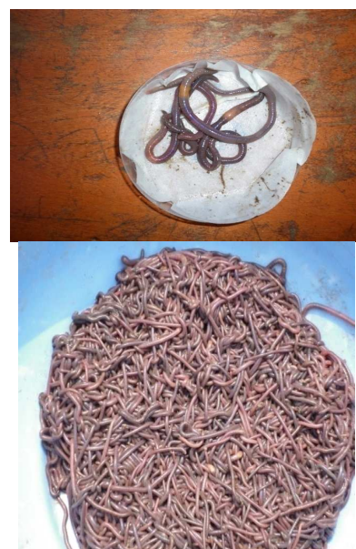
Figures 1(a) and (b). Libyodrilus violaceus

Nitrate salts of heavy metals were used namely: zinc nitrate hexahydrate [ Zn(NO_3)_2 \cdot 6H_2O ], lead nitrate [ Pb(NO_3)_2 ], and cadmium nitrate tetrahydrate [ Cd(NO_3)_4 \cdot 4H_2O ]. Deionized water was obtained from the Chemistry Department of the University of Lagos. All test reagents used were analytical grade from Kem Light Laboratories PVT Limited, India